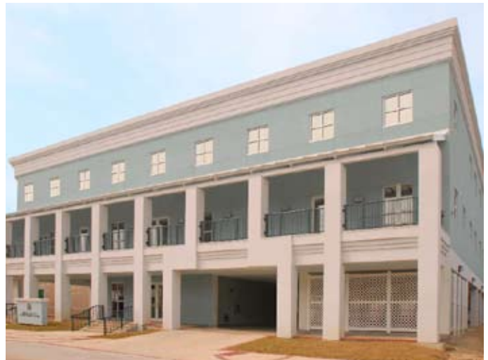
Slidell Municipal Center, Building #1