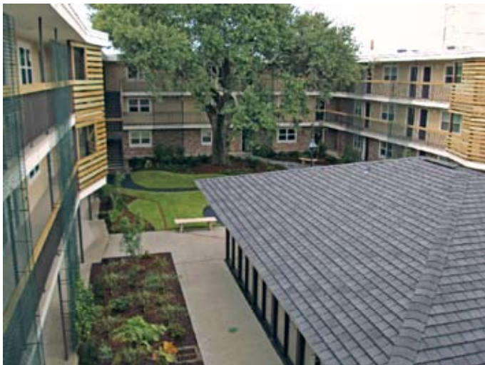
Renovation to the Chateau Carre Apartments